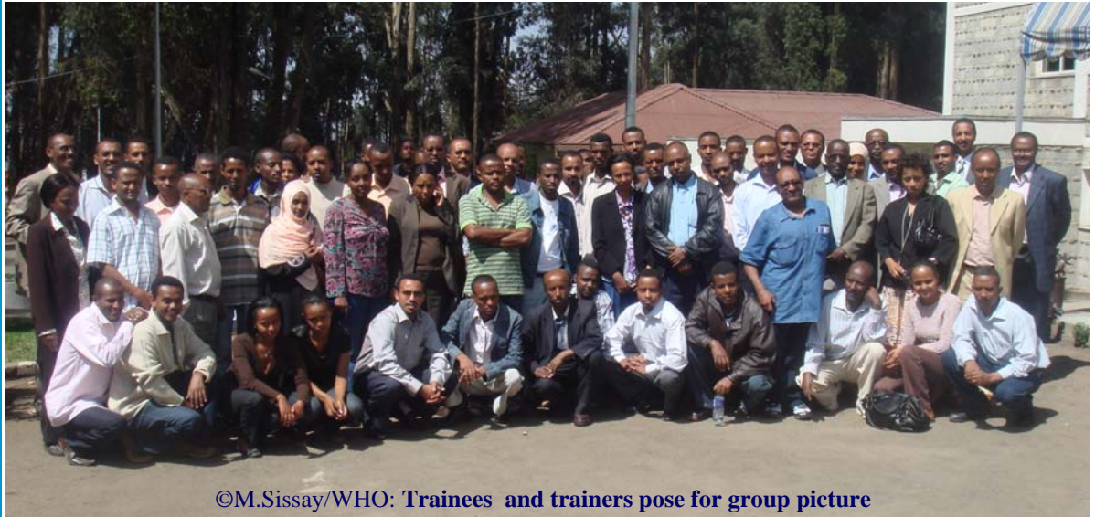
Trainees and trainers pose for group picture

Ethiopian Health and Nutrition Institute (EHNRI) in collaboration with the World Health Organization (WHO) conducted a training of trainers, on 09 May 2009 here in Addis Ababa, in a bid to orient Regional Health Bureau Focal Points, academia, private health institutions as well as Hospital Medical Directors in emergency preparedness and response to Pandemic Influenza in light of the new Influenza A (H1N1).