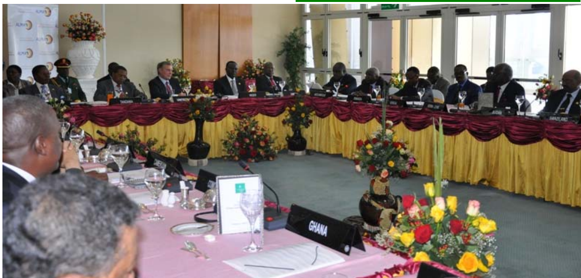
African Heads of State convening on malaria challenges facing the continent